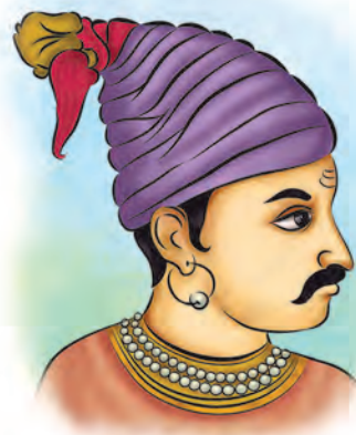
Chhatrapati Rajaram Maharaj

Chhatrapati Shivaji Maharaj. He was born on 24 February 1670 on Raigad. He became Chhatrapati after the death of Sambhaji Maharaj. Now Aurangzeb thought that his