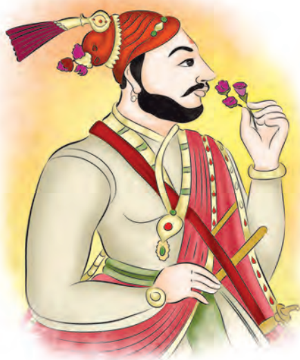
Chhatrapati Sambhaji Maharaj

Sambhajiraje speaking... Present a role play.